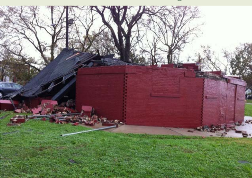
Gazebo in Riverview Fisk Park the morning after SuperStorm Sandy

RNA has unofficially be told that FEMA will provide 75% of the estimated reconstruction costs of the Gazebo ($170,000) which should enable it to be made ADA compliant and that the State will be involved with the review and disbursement of the funds.